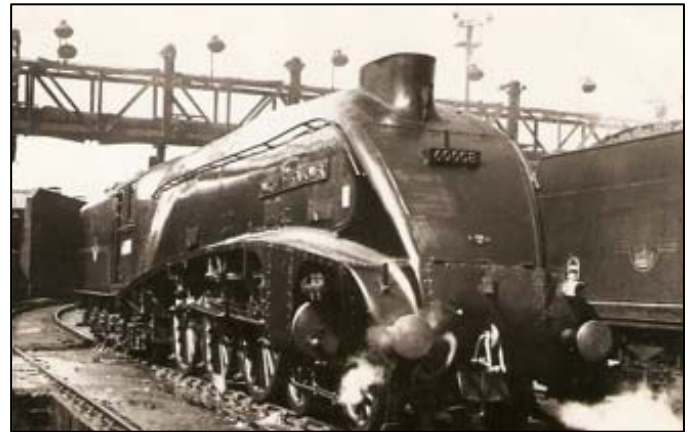
Top: The refurbished Eisenhower locomotive back home after a trip to York, England, for the "Great Gathering." Bottom: Arrival of the Eisenhower in York, England.