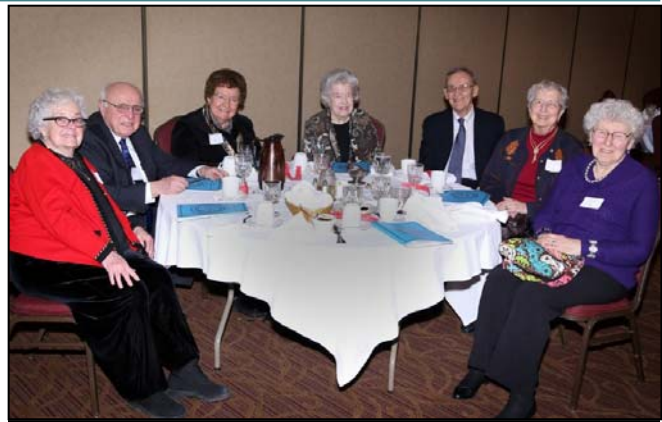
Members and guests enjoying the program at the 2015 BCHS Awards dinner and annual meeting.