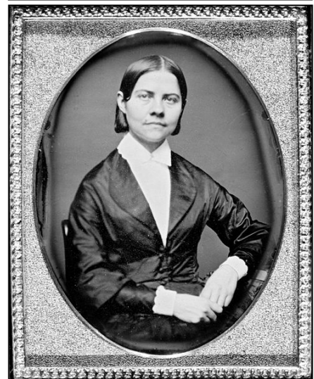
Top: Lucy Stone Speech marker in Viroqua, Vernon County (2013). Bottom: Daguerreotype of Lucy Stone, American suffragist.