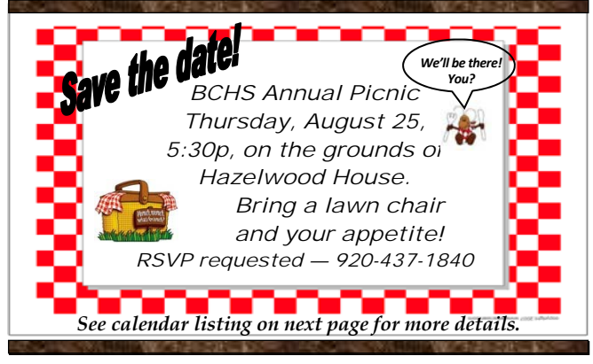
*Events can be added, changed or cancelled without notice. To make sure you stay informed, make our website one of your Favorites — <u>www.browncohistoricalsoc.org</u>!

Join Fox River Tours aboard River Tyme as we journey from De Pere to Leight Park in Green Bay. See the Tall Ships from the water and learn about them along the way. This Public + Cruise is extra special because a portion of the proceeds will benefit Brown County Historical Society. Book a tour at 9:00a, 12:00n, or 3:00p. Cost is $31/person. For reservations, call <u>920-422-6300</u> or go to: <u>foxrivertours.com</u>.