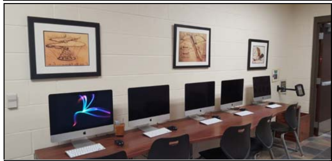
Top Left: Original water fountain. Photo courtesy of Berners-Schober archive. Top Right: Water fountain which incorporates a blend of the old (floor tiles, and new (water fountain with refillable water bottle option and new tile. Photo by Jo-Ann Metzler, Leonardo Da Vinci School.. Center: Classroom from days gone by. Photo courtesy of Berners-Schober archive. Bottom: Computer work station in the hallway outside of the Thinking Studio (library. Photo by JoAnn Metzler, Leonardo Da Vinci School..

Schools for their foresight in providing a new home for a growing program by retrofitting a significant downtown building. This act should be significant to eliminate the "brain drain" where parents of these special students do not need to move to another school district to meet the needs of their child.