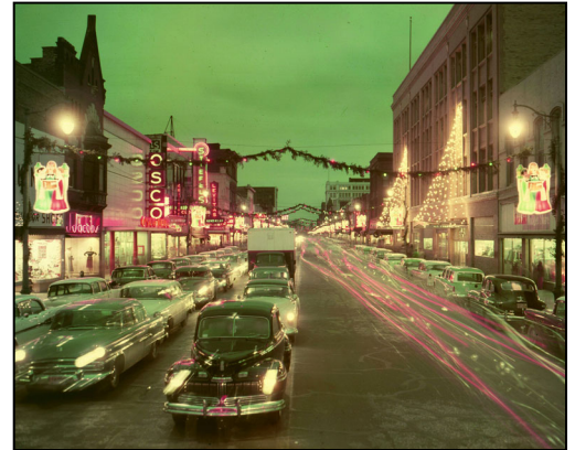
View from old Main Street looking south on Washington Street (circa 1955).

A new feature, From the Vault, takes the user to our digital archives; the images found there are also available for purchase. Currently there are only a few images in the vault, but the archive group is working to expand this and welcomes new members to their group. If interested, contact bchsarchivegroup@gmail.com .